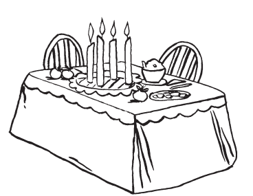
Eat as a family