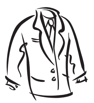
Get dressed up

What are some unique things that you do on this day of the week? Circle them below.