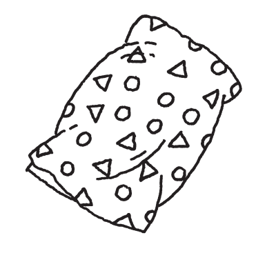
Keep it under your pillow